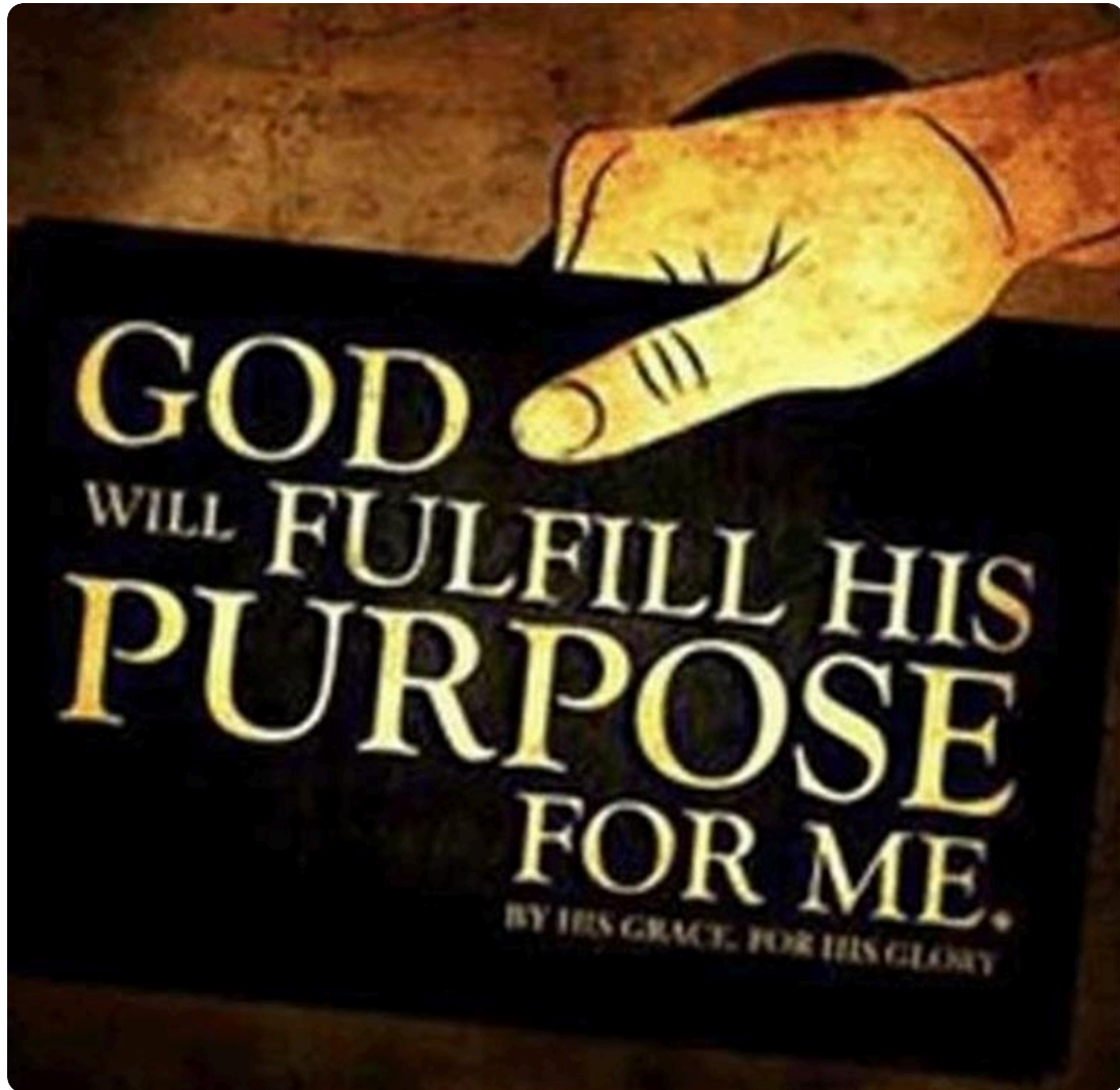
This Memorial Day, I lift you up in prayer my brother!